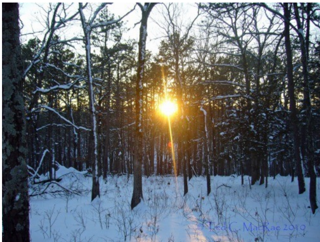
Arriving back at White Oaks Trailhead with a few minutes to spare.

Sadly, there would not be time to visit the shut-ins. The short February day conspired with our snow-slowed pace to leave us with a too-low-sun by the time we reached the fork in the trail that led to the shut-ins, a mile in one direction, and our car, a mile in the other. Although we (both) had thought to carry flashlights (just in case), the last thing I really wanted to do was find myself stumbling over snow-covered trails through the dark with my 10-yr old daughter. Even had we survived the nighttime winter woods, I might not have survived the inevitable maternal reaction to such an escape.