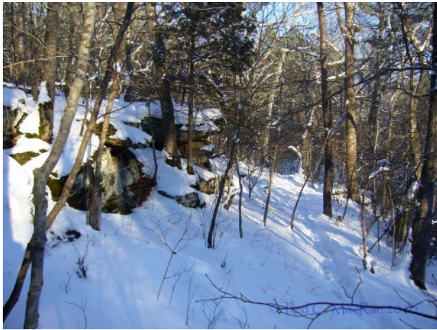
More Lamotte sandstone exposures along Pickle Creek, Whispering Pines Trail.

miniature gorges. Upstream from the shut-ins, Pickle Creek runs lazily through the softer Lamotte sandstones that overlay those ancient rhyolites, combining with the snow cover to create a scene as peaceful and serene as any I've ever witnessed.