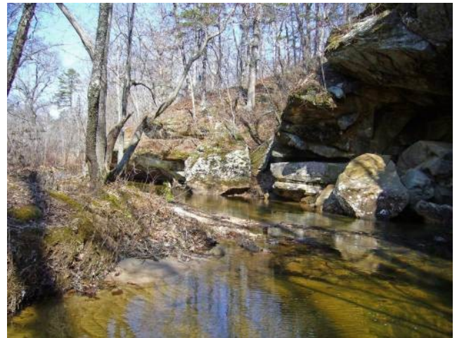
Same place as above in February 2009.

taken at almost exactly the same spot one year ago in February 2009.