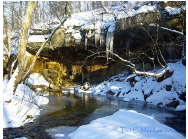
Icicle formations along Pickle Creek, Whispering Pines Trail.

Just above the shut-ins, Pickle Creek bends to the west, carving deeply into the soft sandstone. The porous nature of the rock allows moisture to trickle through and between the strata from the hillside above, creating seep zones that weaken underlying layers and lead to their collapse. The abundant moisture this winter and continuous cycles of daytime thawing and nighttime freezes have resulted in extraordinary ice formations along the bluff face and underneath the overhanging layers, the likes of which are rarely seen in our normally more open winters. Compare the scene in the first photo below with that in the second,