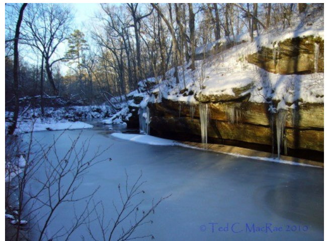
Pickle Creek along Whispering Pines Trail.

Ice rarely forms over the small ponds and lakes that dot the Ozark Highlands, much less its creeks and other moving waters. The scene below of