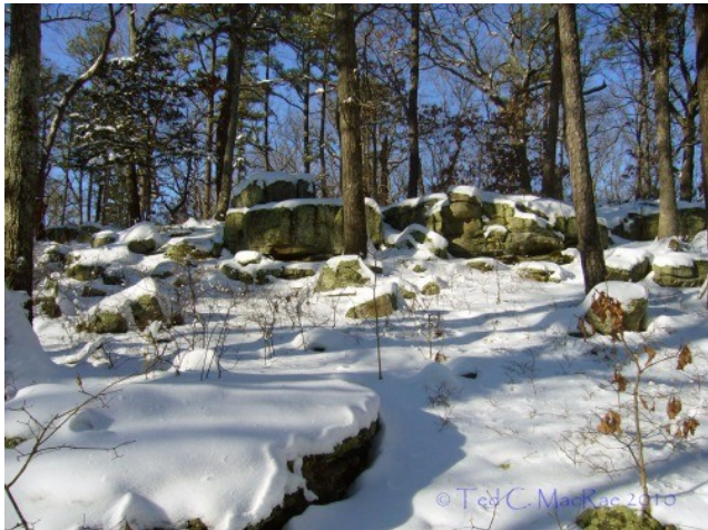
Lamotte sandstone outcrops on the White Oaks Trail.

snow events. I'm sure my northern (and Patagonian) friends are not impressed, but at our middlin' latitudes snow falls rather infrequently and rarely sticks around for long when it does. This winter has been different, with snowfall almost every week, it seems like, and temperatures that have remained cold enough to keep it around for awhile. While this latest snowfall measured only a modest 1-2 inches here in the St. Louis area, a 7-inch blanket (as measured by my hiking stick) fell in the Ozark Highlands just south of here. Coming as it did at the start of the weekend, I welcomed the opportunity to go for a hike — among my favorite wintertime activities — in a landscape that is rarely seen covered in deep, newly-fallen snow. My daughter Madison loves hiking as much as I do ( even in deep snow ), so the two of us headed off to perhaps my favorite of Missouri's public areas, Hawn State Park . I have long adored Hawn for its premier hiking, fascinating geology , and unusual flora , and every time I visit I find something new to love about it.