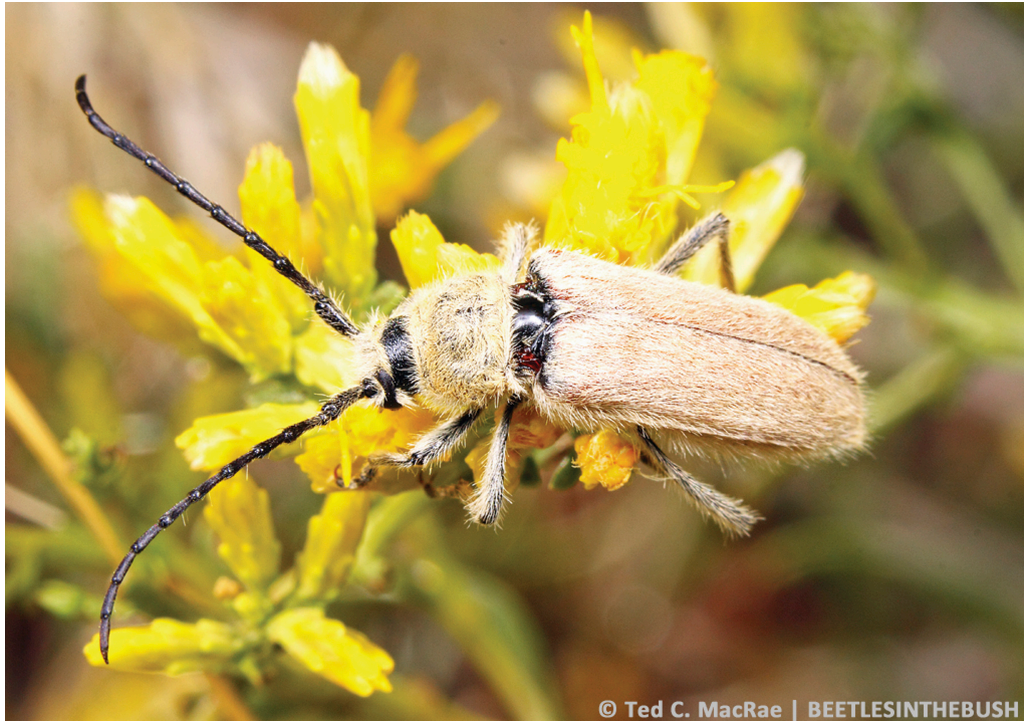
Fig. 1. Crossidius hirtipes allgewahri LeConte.